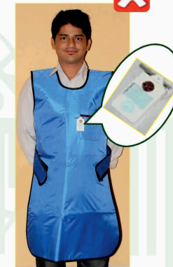
TLD above apron