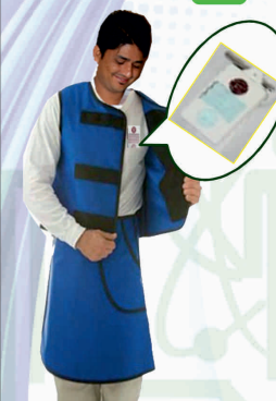
TLD below apron