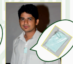
TLD without cassette