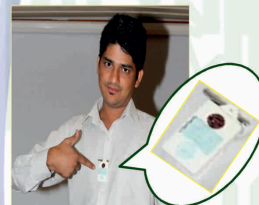
TLD with cassette